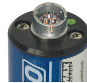
Environmental 10 Pin MS Connector compatible w/951 & 952 LDT's w/connector option "E"